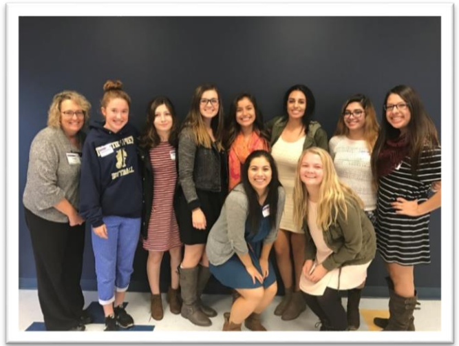
Some of our amazing Prep women at the Women Helping Women Luncheon

December 21 – Finals day three, Alumni Mass, school releases at 11:20 am