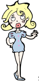
She's totally getting dress-coded

We ask that dress & skirt lengths are no more than 4 inches above the knee. Now we know that those with longer legs can have a hard time exactly meeting that measurement, but if we see that the length is way more than 4 inches, you'll be dress coded. Just keeping it real.